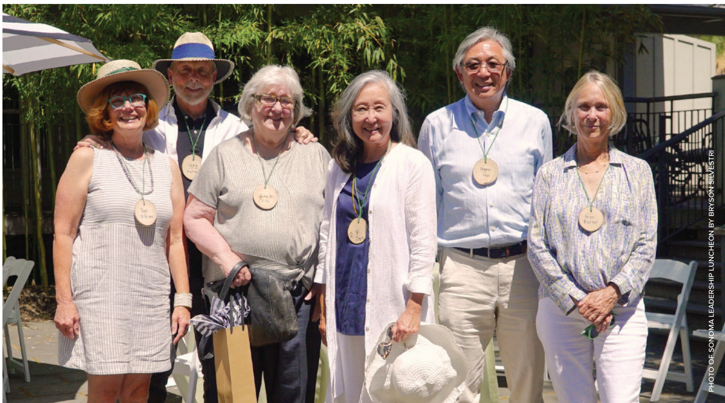
PHOTO OF SONOMA LEADERSHIP LUNCHEON