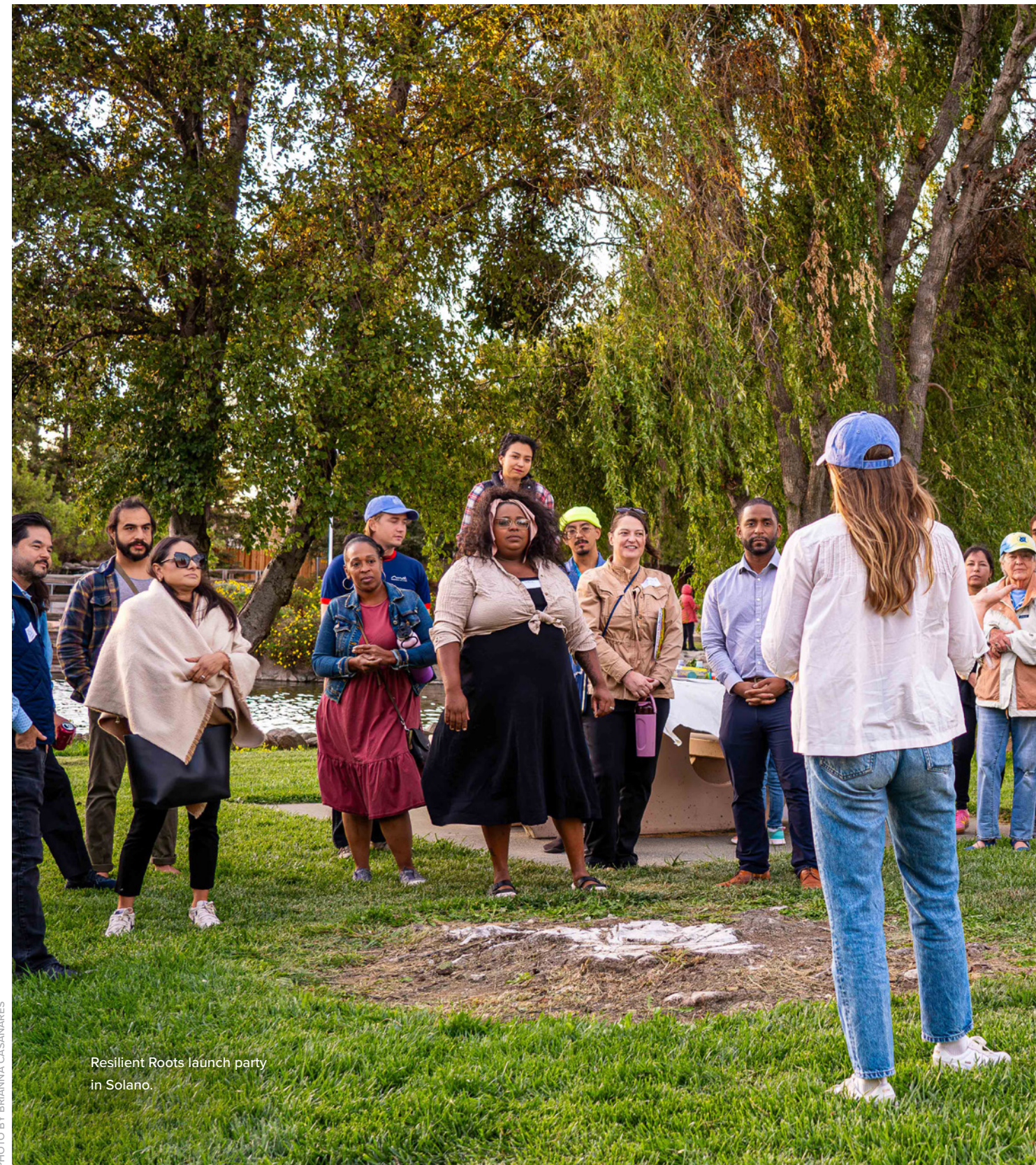
Resilient Roots launch party in Solano.

In Sonoma County, Greenbelt Alliance spearheaded the advocacy campaign resulting in City of Petaluma voters supporting—once again—the renewal of the Urban Growth Boundary by passing Measure Y. This win will