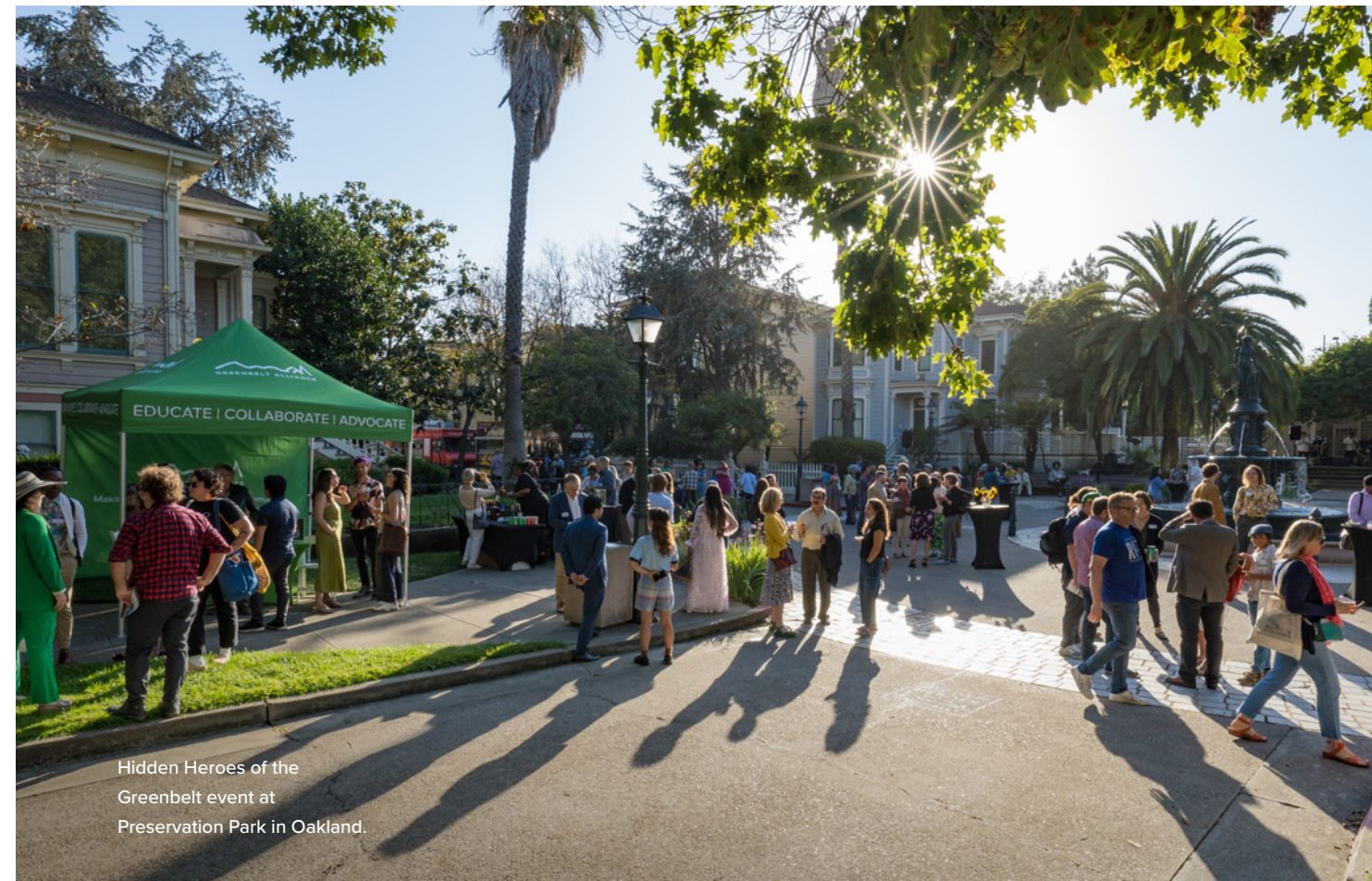
Hidden Heroes of the Greenbelt event at Preservation Park in Oakland.